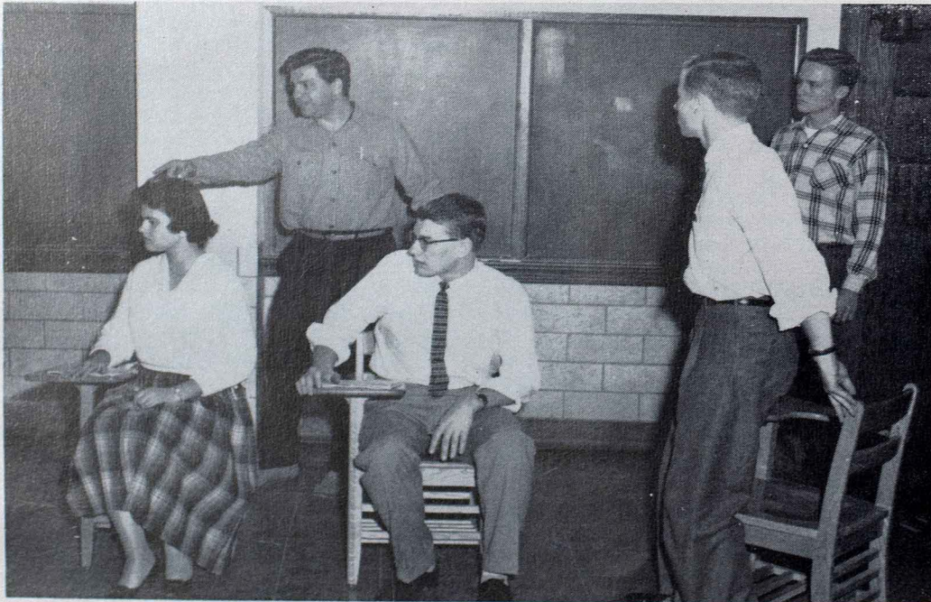
A group of students in the class in play direction, one of the courses offered in the Division of Language and Literature