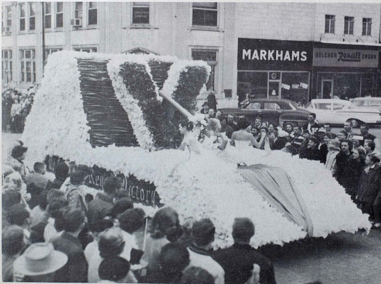
Judged most beautiful float in the Homecoming parade was the entry of the Baptist Student Union