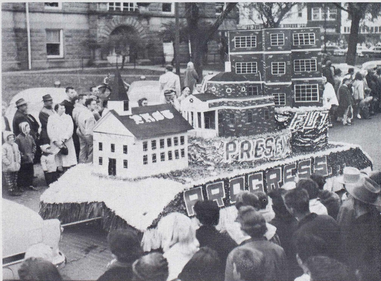
The Newman Club's float which won first place for the best representation of the spirit of Homecoming