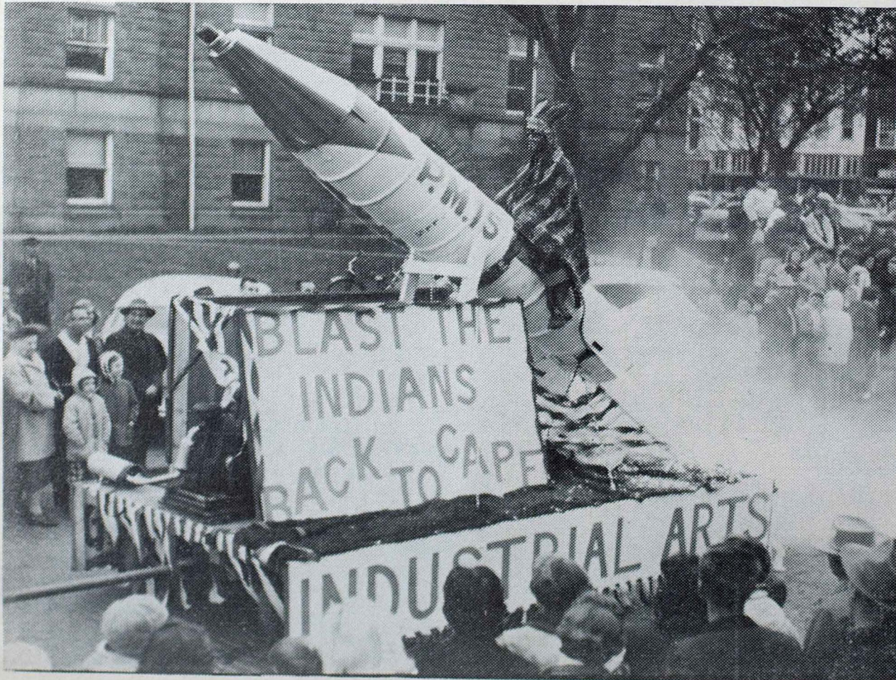
First prize in the mechanical division for Homecoming floats was the entry of the Industrial Arts Club