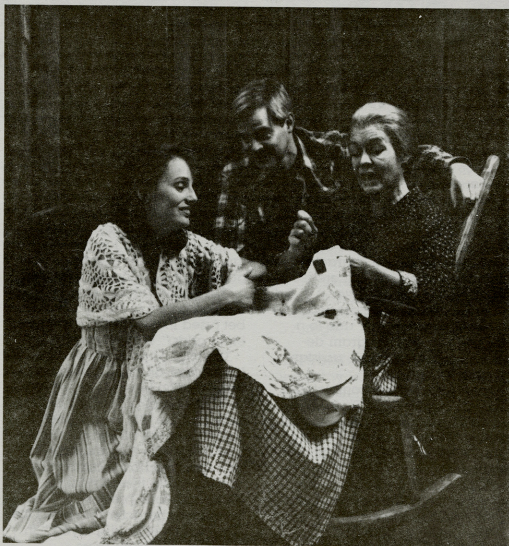
The Guthrie Theater will appear at NMSU as part of the Lyceum

NMSU students, faculty and staff may pick up free tickets to "Foxfire," Thursday and Friday and Jan. 28-29 at the Student Activities Board Office in the Student Union Building or at the door.