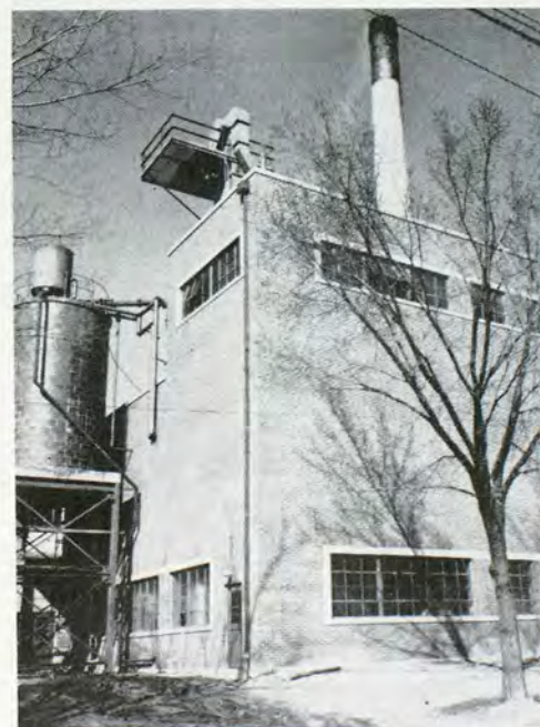
New Heat and Power Plant