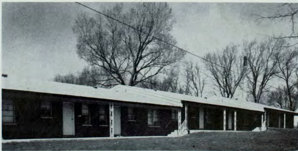
The Fair Apartments