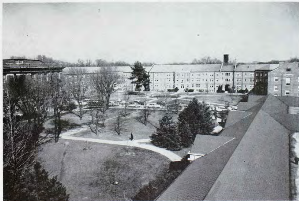
A View of Brewer, Nason, and Blanton Halls Taken On Top of New Heat Plant