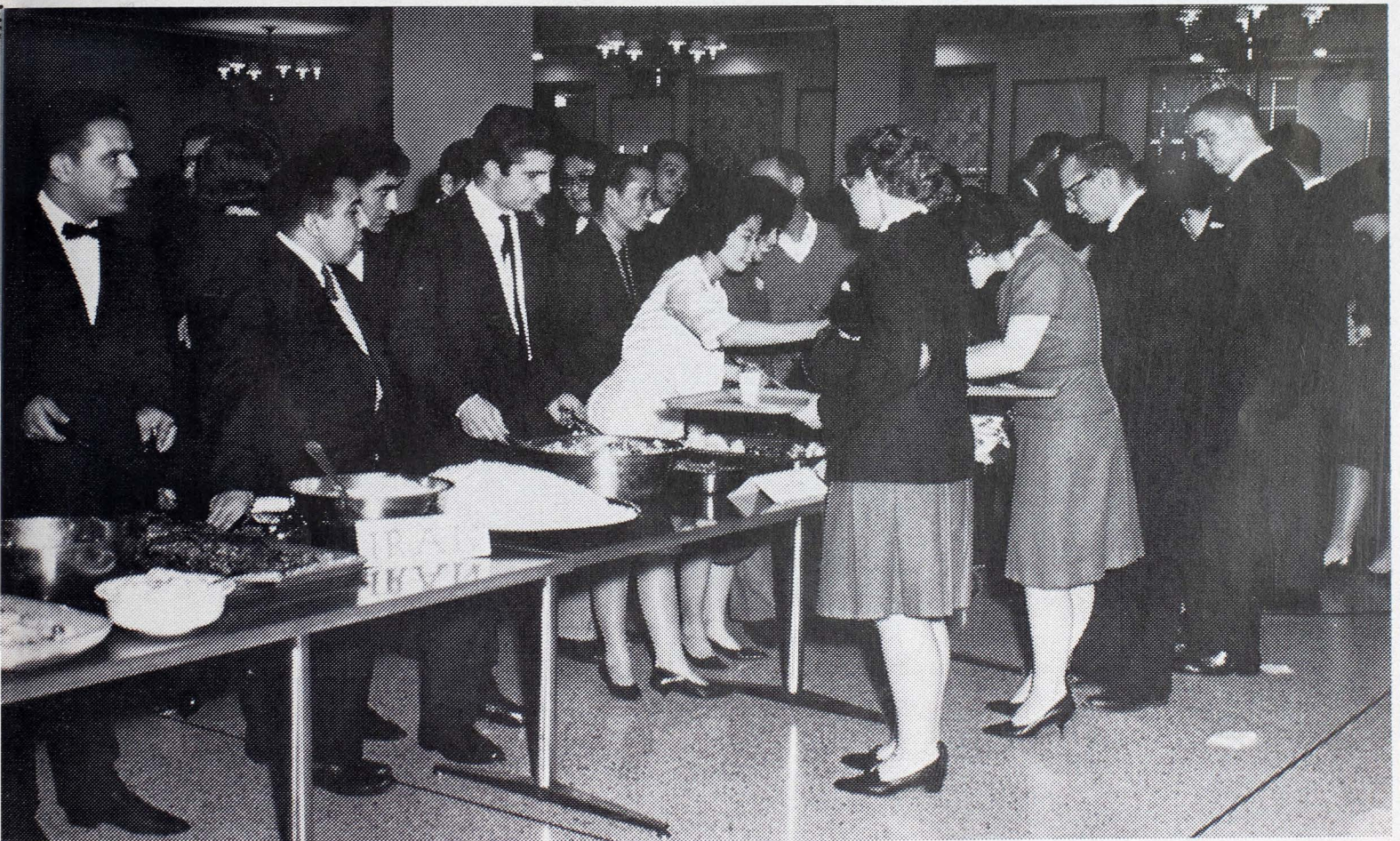
Foreign students at the Teachers College and their guests pictured at the annual International Club banquet January 30. The dining room of Ryle Hall was transformed into a United Nations restaurant with food from fourteen countries cooked and served by the club members to a large group of guests.