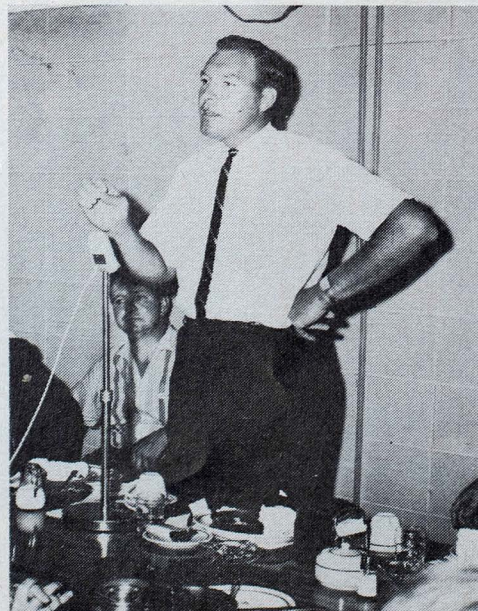
Harry Gallatin speaking at a luncheon meeting of the Kirksville Quarterback Club last June.

Harry Gallatin, 1949, was named coach of the New York Knickerbockers, professional basketball team, one week after being replaced as coach of the St. Louis Hawks. Gallatin, dubbed the "Iron Man of Basketball" for his long string of professional games, starred with the Knickerbockers for nine seasons. He was elated about the appointment. "Returning to New York is just great," he said.