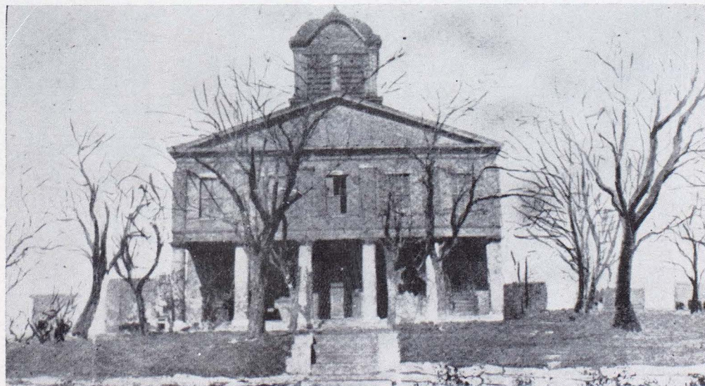
This Courthouse Was Destroyed by Fire in 1908

Sullivan County, formerly known as Highland County, was organized with its present boundaries February 14, 1845. The county was named Sullivan in honor of General Sullivan of the Revolutionary War. The town of Milan was selected as the seat of justice for Sullivan County. On August 3, 1846, the county court met in Milan for the first time. The first court house was of hewn logs and was built in 1847 and served the county until 1858 when a two-story brick court house was built in the center of the public square at a cost of about $5,000. It was colonial in style. It was destroyed by fire June 26, 1908. It was many years before it was replaced by the modern