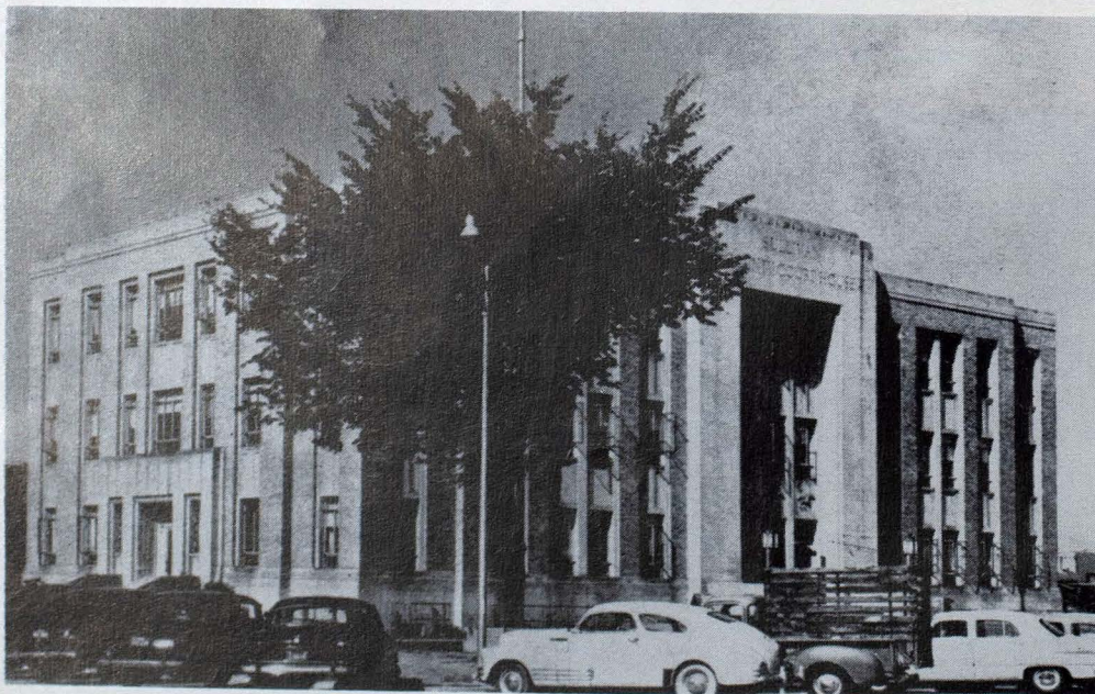
Present Sullivan County Courthouse located in Milan, Missouri.

There are two weekly county newspapers published. They are the Green