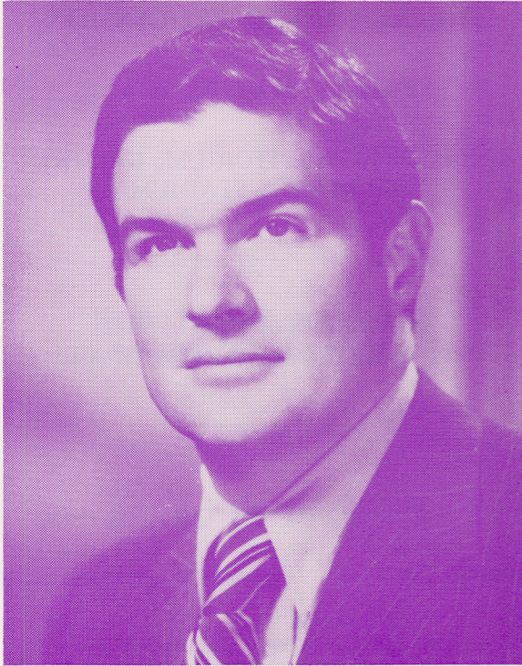
CHRISTOPHER S. BOND GOVERNOR OF MISSOURI

Christopher S. Bond was inaugurated as the forty-seventh governor of Missouri on January 8, 1973, when he was 33. He was the youngest governor in the history of the state. He is the ninth Republican elected governor. His victory marked the first election of a Republican Governor in Missouri since 1940.