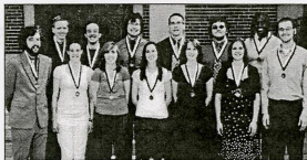
Students who received General Honors stand with their General Honors Medals following the ceremony.

The Center for Student Involvement (CSI) is now accepting registration for the 2008 Activities Fair, to take place from noon-4 p.m. Sept. 4 on the Quadrangle. All campus departments and student organizations in good standing with the CSI are eligible to register. Registration forms are available in the Center for Student Involvement or at http://studentinvolvement.truman.edu . The first 100 organizations to sign up will be entered into a drawing for a prize.