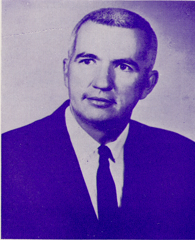
WILLIAM L. (BILL) HUNGATE Representative, Ninth District of Missouri