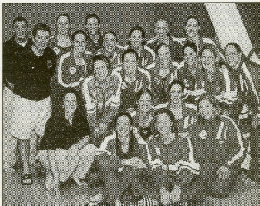
The Truman women's swimming team gathers at the NCAA Swimming and Diving Championships.

The Bulldogs won four relay events and five individual championships.