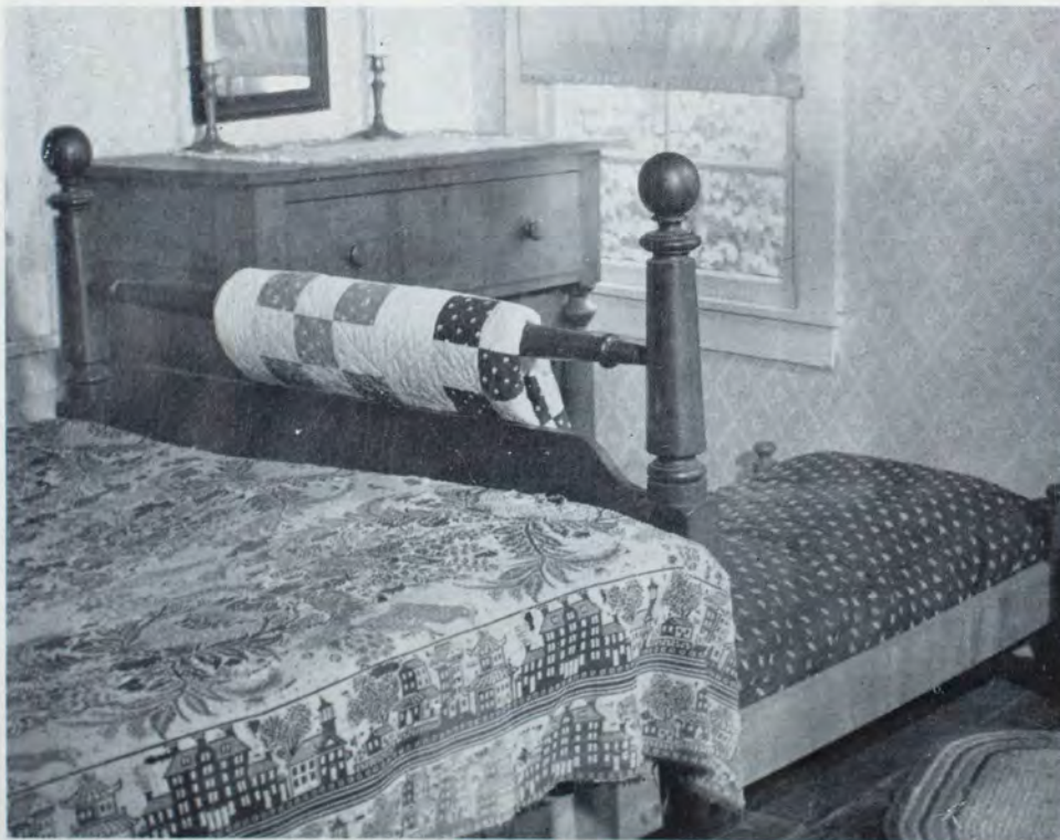
"Tom's" bedroom. The window is the one referred to by "Tom" in relating his nocturnal escapades.

The Standard-Times under Mr. Brewer has maintained and increased the long-standing prestige of The Evening Standard, founded nearly 100