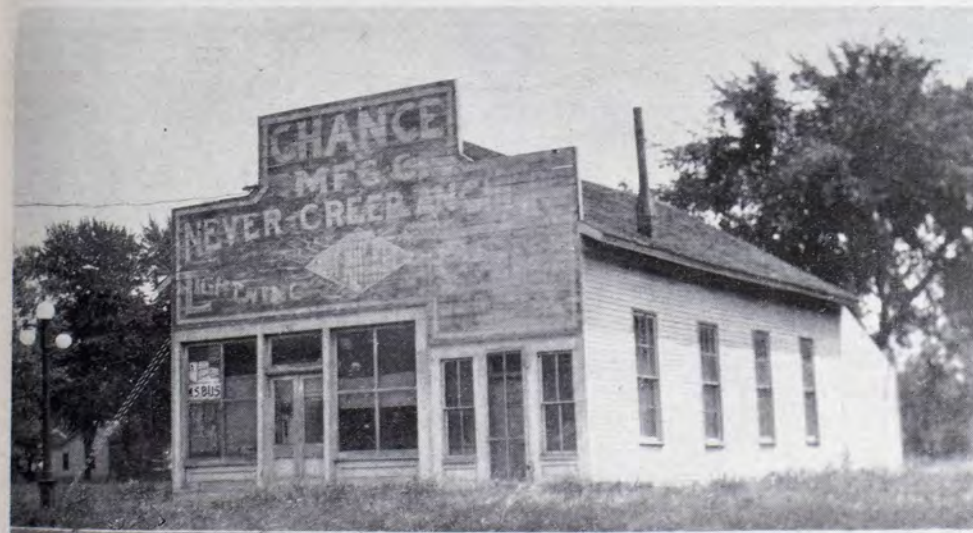
First Factory—1907—Abandoned Church Building

In December of 1945 the postwar plans of the Company began to materialize with the acquisition of the Bowie Switch Company of San Francisco, a move which diversified the line even further and made for increased job security. By mid-1946 the California plant was Chance-operated, with several former Centralians at the