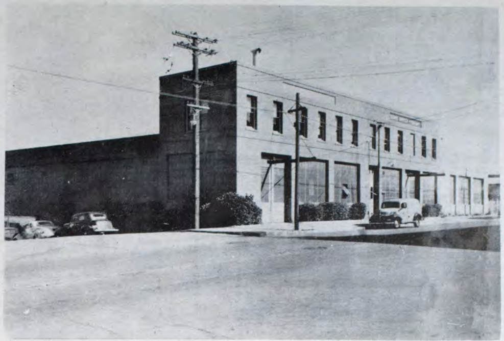
A. B. Chance Co. Switch Plant—San Francisco

The Tips Tool Company was a pioneer in the manufacture of live