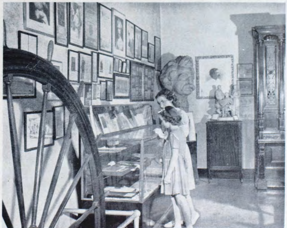
Portion of the Pilot's wheel from an early river steamer of Mark Twain's day as a pilot on the Mississippi is shown here.

The red and gray academic gown worn by Mark Twain when Oxford University conferred an honorary degree upon him was always a source of admiration and pride to the one-time Missouri printer and river pilot. The inscription on the glass case in which