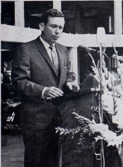
Governor Hearnes speaking at the dedicatory services for Missouri Hall May 20.

Progress has also been made in capital improvement expenditures since the 1961-63 biennium. For 1961-63 the