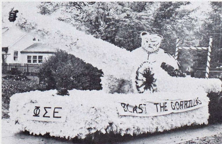
The Phi Sigma Epsilon float which won the traveling trophy for the best Homecoming float in all categories. (Story on Page 7)