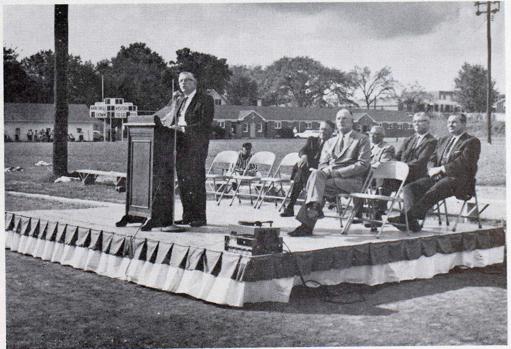
President Ryle speaking at the rededication ceremonies for the new Stokes Stadium

The Reed Construction Co. of Kirksville built the new concrete structure, which will seat at least 4,500 spectators. Other features of the stadium are redwood seating and an enlarged pressbox.