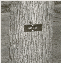
Name plates like this one were attached to trees throughout campus this spring.