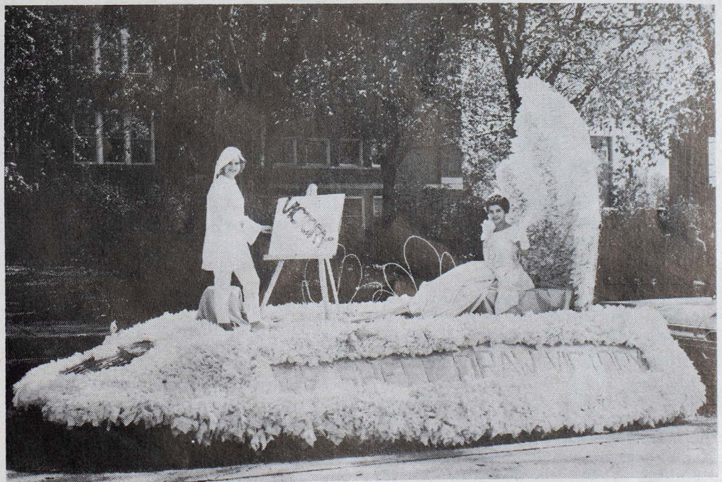
The best all-around float and the first prize winner in the category of beauty in the Homecoming parade entered by the Honorary Art Club.