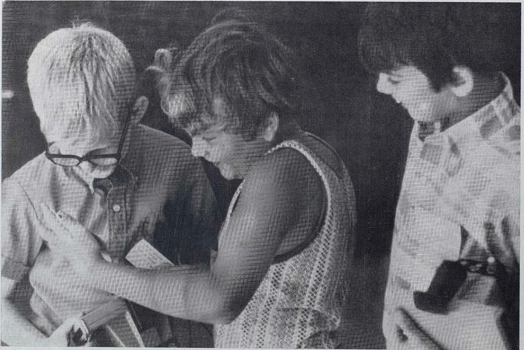
KIRKSVILLE ELEMENTARY SCHOOL STUDENTS seem to be enjoying themselves as participants in the Environmental Studies Program held on the NMSC campus this summer. Some 25 to 40 elementary and junior high students from the Kirksville area took part in the summer program.