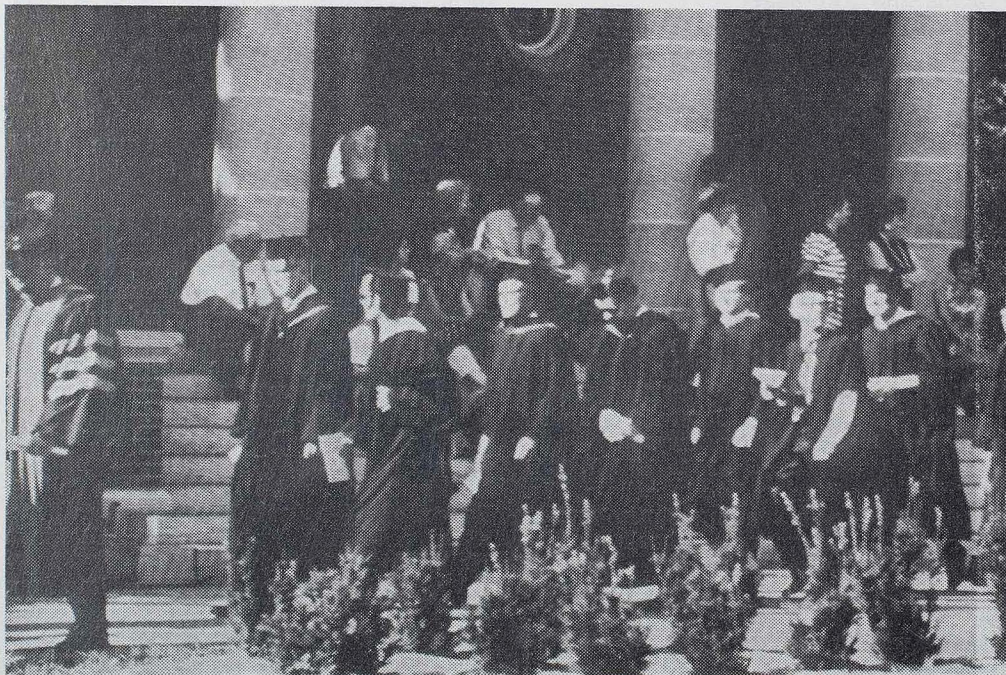
THE TRADITIONAL COMMENCEMENT PROCESSIONAL marches by the Kirk Memorial enroute to the Pershing Building. A near capacity crowd attended the Summer Commencement on August 13.