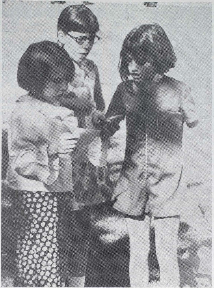
That is a picture of power!